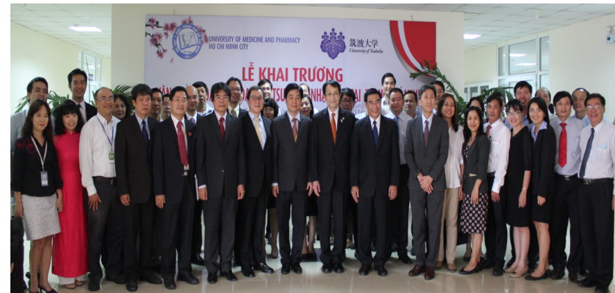
Opening ceremony of The representative office of Tsukuba University

UNIVERSITY OF MEDICINE AND PHARMACY, HO CHI MINH CITY