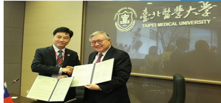
Ceremony of signing MOU in Taipei Medical University