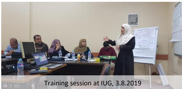
Training session at IUG, 3.8.2019

111 Palestinian academics working in different academic disciplines across the eight universities and colleges in the Gaza Strip successfully completed the AEU’s pedagogical programme. 80% of the participants are IUG staff while 20% come from other higher education institutions in the Gaza Strip.