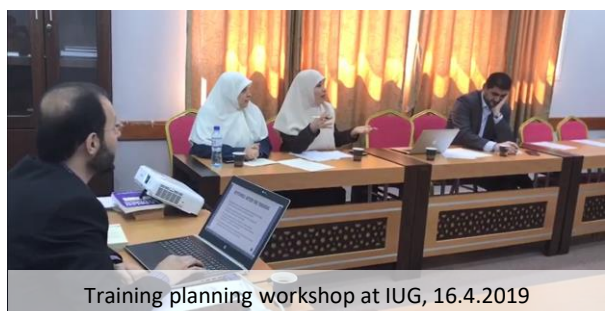
Training planning workshop at IUG, 16.4.2019

The project was implemented based on the identified local needs through inclusive decision-making and equal partnership between the project partners. The training programme built local pedagogical expertise and context-appropriate solutions to enhance quality of Palestinian higher education. A team of qualified pedagogical trainers further trained a larger number of Palestinian university teachers disseminating modern academic teaching approaches. 127 academics from 8 higher education institutions in the Gaza Strip participated in pedagogical development activities during the project.