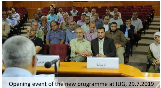
Opening event of the new programme at IUG, 29.7.2019

111 Palestinian academics working in different academic disciplines across the eight universities and colleges in the Gaza Strip successfully completed the AEU’s pedagogical programme. 80% of the participants are IUG staff while 20% come from other higher education institutions in the Gaza Strip.