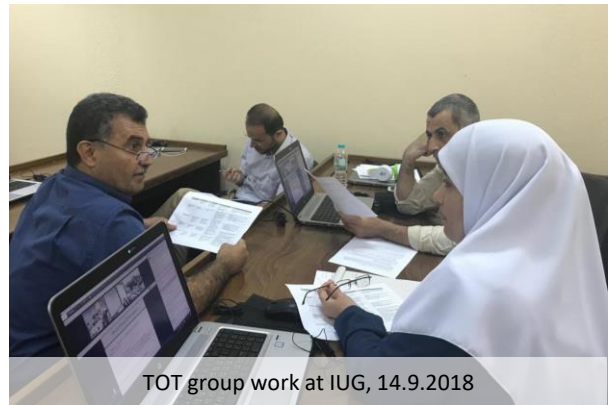
TOT group work at IUG, 14.9.2018