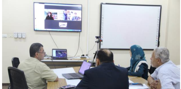
IUG team in an online project meeting, 9.11.2017

The continuous support and commitment of the IUG's management and relevant institutional structures have been crucial for the success and sustainability of the project's achievements.