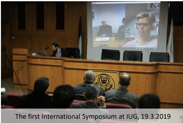
The first International Symposium at IUG, 19.3.2019