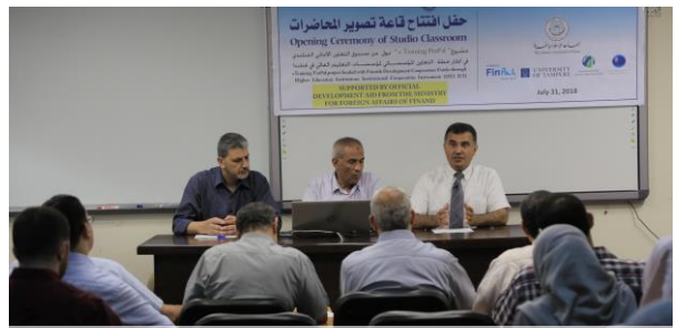
Studio classroom opening ceremony at IUG, 31.7.2018