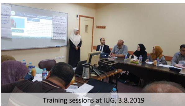
Training sessions at IUG, 3.8.2019