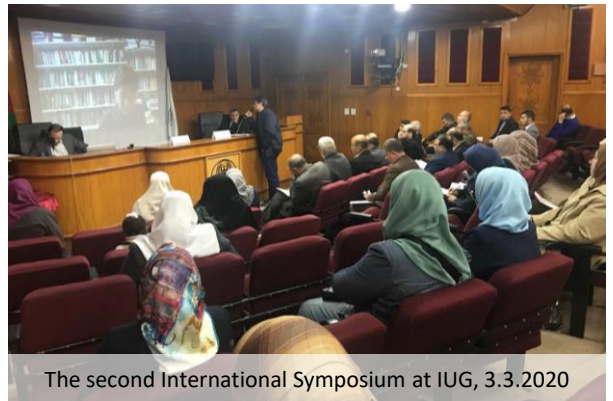
The second International Symposium at IUG, 3.3.2020

Two international symposiums that were organised at IUG gathered around 150 attendees including training participants, IUG students and staff, representatives of other education institutions in the Gaza Strip, and representatives of the Palestinian education authorities. International speakers and TAU team joined via video-conference connection.