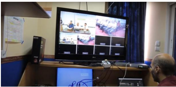
Studio classroom opening ceremony at IUG, 31.7.2018

IUG teaching staff uses the AEU facilities to record lectures for their students thus enabling distance education. 360 lectures were recorded in the studio classroom during the project. AEU uses the computer classroom to organise training on using different digital learning platforms in teaching (such as Moodle). 247 IUG staff members took part in these training sessions during the project. AEU facilities were especially important during the corona pandemic in 2020 when all IUG courses were taught online.