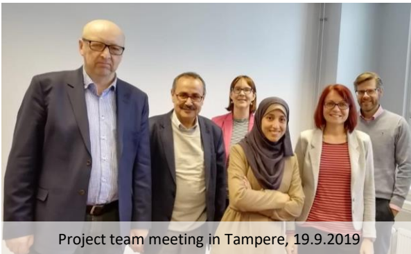
Project team meeting in Tampere, 19.9.2019

The IUG project team travelled to Finland in September 2019 together with 2 IUG pedagogical trainers and 2 IUG professors of education. The project team collaborated mainly online: 36 meetings were arranged online and 3 were held in Tampere.