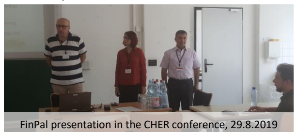
FinPal presentation in the CHER conference, 29.8.2019

The project-related research was presented in six conferences: Adult Education Conference 2018 in Finland, EAIR 2018 in Hungary, ECER 2018 in Italy, FERA Conference on Education 2018 in Finland, Pedaforum 2019 in Finland, CHER 2019 in Germany.