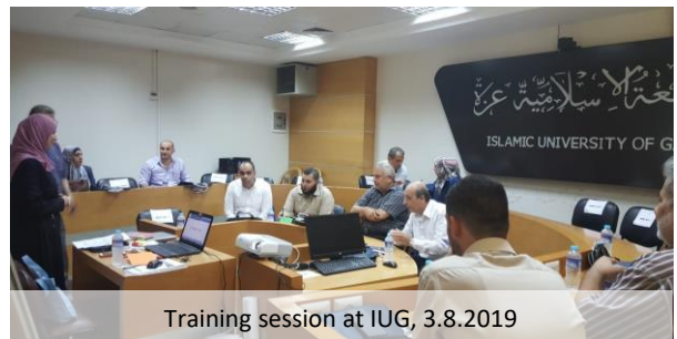
Training session at IUG, 3.8.2019

To support pedagogical development of its teaching staff, IUG implemented a new institutional policy that recognises the merits of the pedagogical training in the annual academic performance appraisal and academic career advancement.