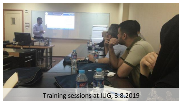
Training sessions at IUG, 3.8.2019

IUG and TAU have expanded their cooperation beyond the duration of the eTraining FinPal project. TAU, IUG and Birzeit University (West Bank, Palestinian Territories) established a staff and student mobility scheme through the Erasmus+ ICM instrument strengthening their research and teaching collaborations. The mobility agreement enables staff and student exchange between Palestinian HEIs and TAU supporting the internationalisation efforts of all three partners. Furthermore, IUG and TAU researchers have collaborated with scholars from European and Palestinian universities and prepared 3 new cooperation proposals submitted to Finnish and European funding bodies.