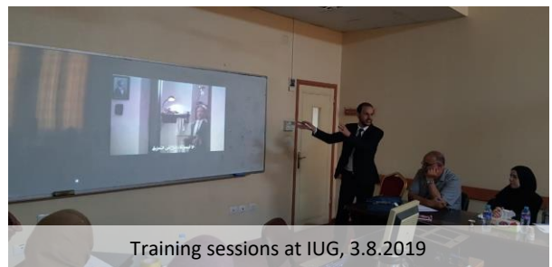
Training sessions at IUG, 3.8.2019