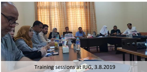
Training sessions at IUG, 3.8.2019

IUG’s Academic Excellence Unit will continue to support pedagogical development of Palestinian academics through its training programme, public lectures and workshops related to enhancement of academic teaching.