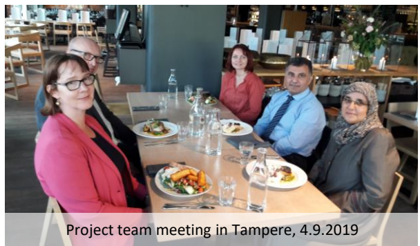
Project team meeting in Tampere, 4.9.2019

The project was implemented based on the identified local needs through inclusive decision-making and equal partnership between the project partners. The training programme built local pedagogical expertise and context-appropriate solutions to enhance quality of Palestinian higher education. A team of qualified pedagogical trainers further trained a larger number of Palestinian university teachers disseminating modern academic teaching approaches. 127 academics from 8 higher education institutions in the Gaza Strip participated in pedagogical development activities during the project.