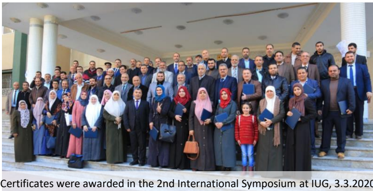
Certificates were awarded in the 2nd International Symposium at IUG, 3.3.2020

To support pedagogical development of its teaching staff, IUG implemented a new institutional policy that recognises the merits of the pedagogical training in the annual academic performance appraisal and academic career advancement.