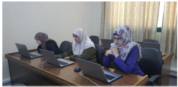
Computer classroom opening ceremony at IUG, 28.2.2018

AEU's facilities and equipment enabled the project to organise the online Training of Trainers and supported the implementation of the project that relied heavily on online collaboration between the project team members. Two multipurpose classrooms benefit the whole university community and enrich the learning environment at IUG.