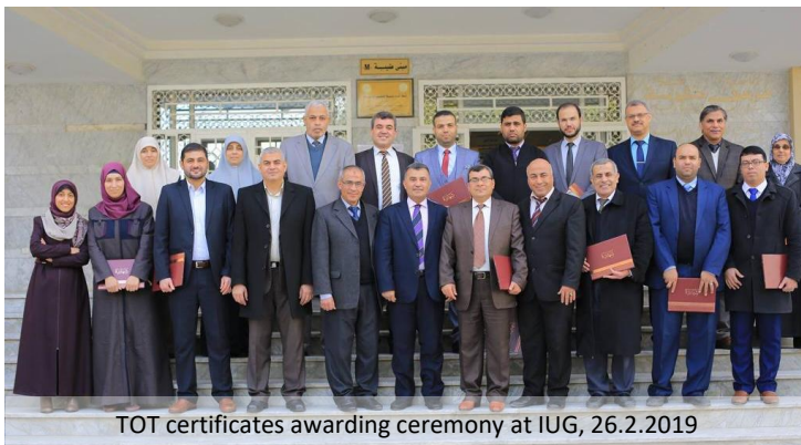
TOT certificates awarding ceremony at IUG, 26.2.2019