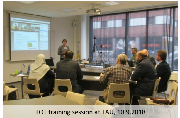
TOT training session at TAU, 10.9.2018

16 IUG academics with different disciplinary backgrounds successfully completed the TOT and became certified trainers on university pedagogy.