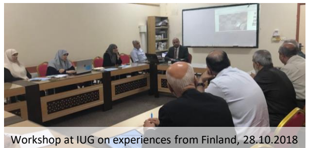
Workshop at IUG on experiences from Finland, 28.10.2018

The project's symposiums and other public events at IUG raised the attention to the issues of pedagogical approaches in higher education and their importance for improving the quality of education throughout the Palestinian higher education institutions.